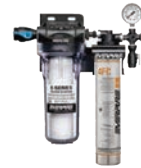
CR-14FCP with Prefilter

Kit includes fittings needed to complete the installation of CR-14FC filter system to Remote Chiller CP2000 and Tower or Faucet CP2000 Series Only