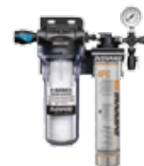
CR-14FCP with Prefilter CR-14FC without Prefilter

Inline Leak detector, and audio alarm and Auto-water shut off device. For use with CP2000 series systems