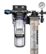
CR-14FCP with Prefilter CR-14FC without Prefilter

In-line Leak Detector with Auto Shut-Off. For use with any Crysalli chiller system