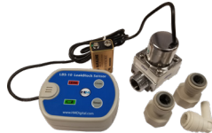
CR-LBS10JG Leak block sensor