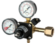
CR-PC160-14FCV CO 2 regulator

The unit comes standard with a filter system built on and a water pressure reducer valve installed. Installation kit comes complete with a CO2 regulator, leak block sensor, hose and angle stop fittings.