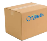
Included installation kit