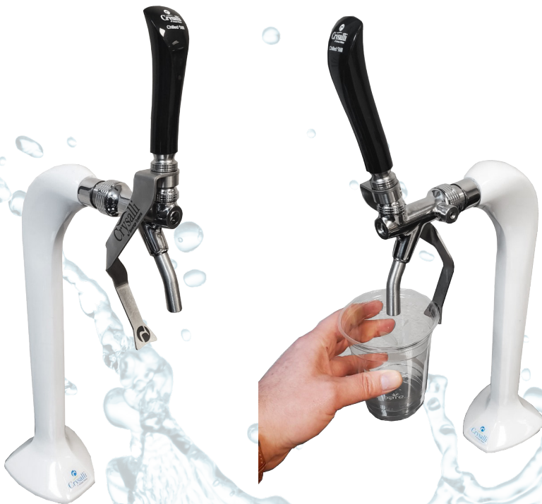
CR-SDL-SSX1 with ergo handle on a CBR-V1WHT